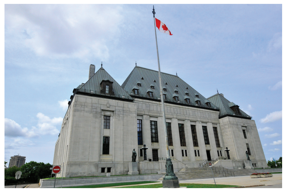
The Supreme Court of Canada is the highest level of the judicial branch of government.