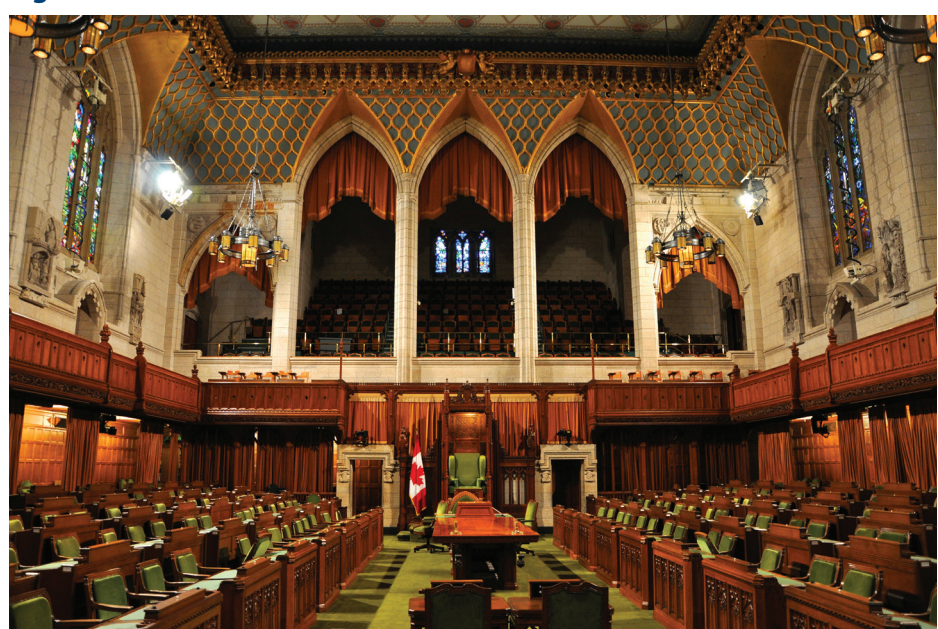
Figure 1.1 Canada's Parliament